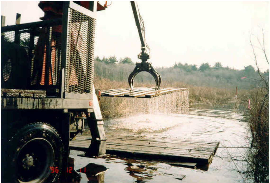
Photograph 3b - Deployment of temporary roadway from support vehicle.