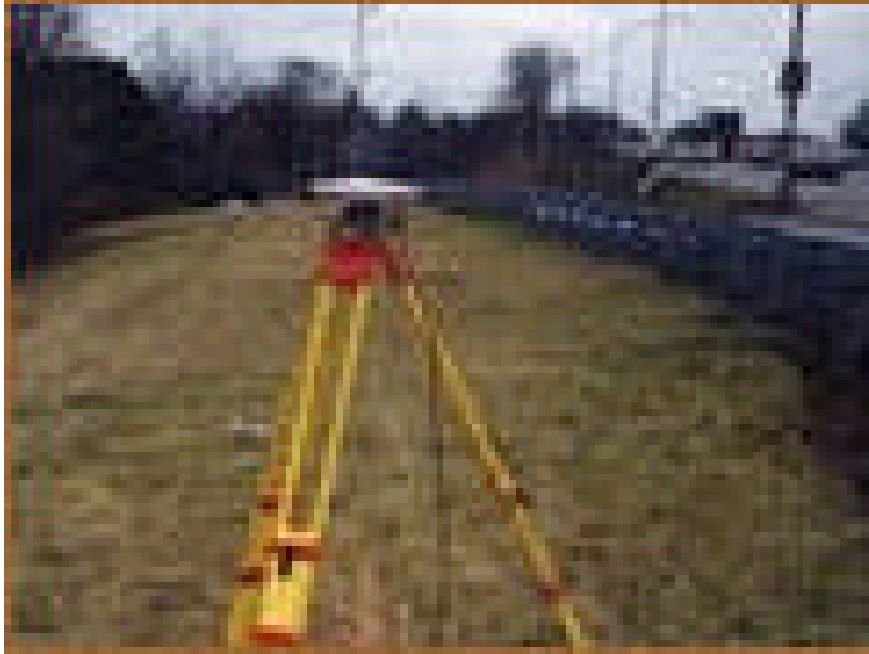
Photograph 5a – Survey equipment.