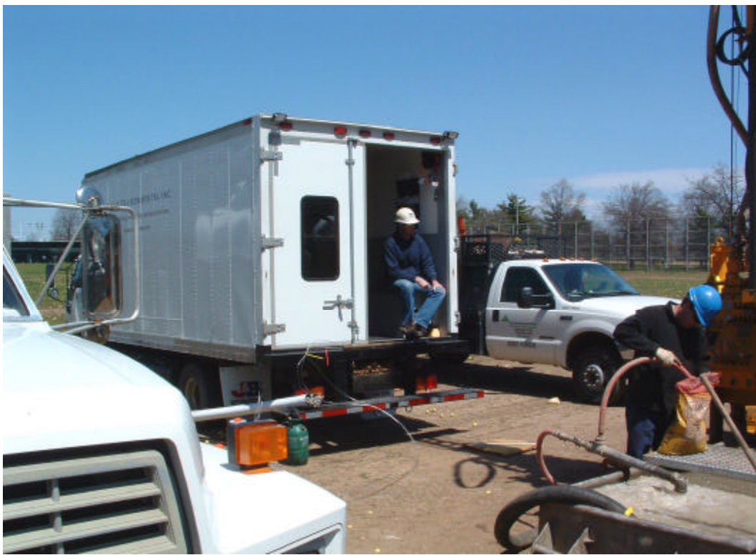
Photograph 2a – Vertical groundwater profiling truck.