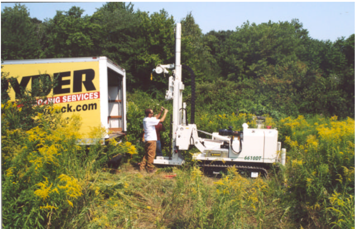
Photograph 2b – Vertical groundwater truck and Geoprobe.