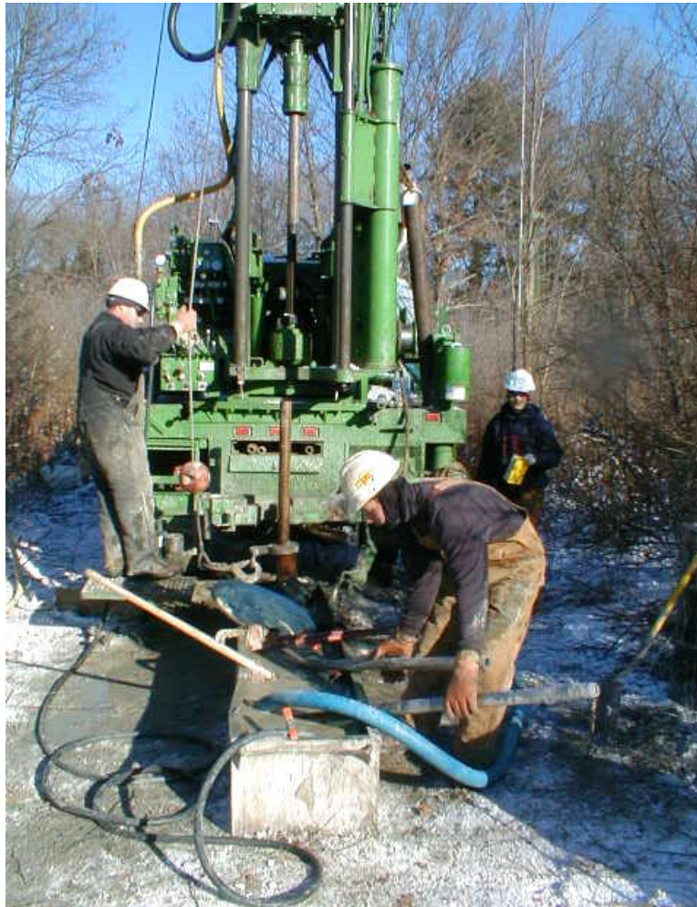
Photograph 1a – Mud rotary drill rig setup.