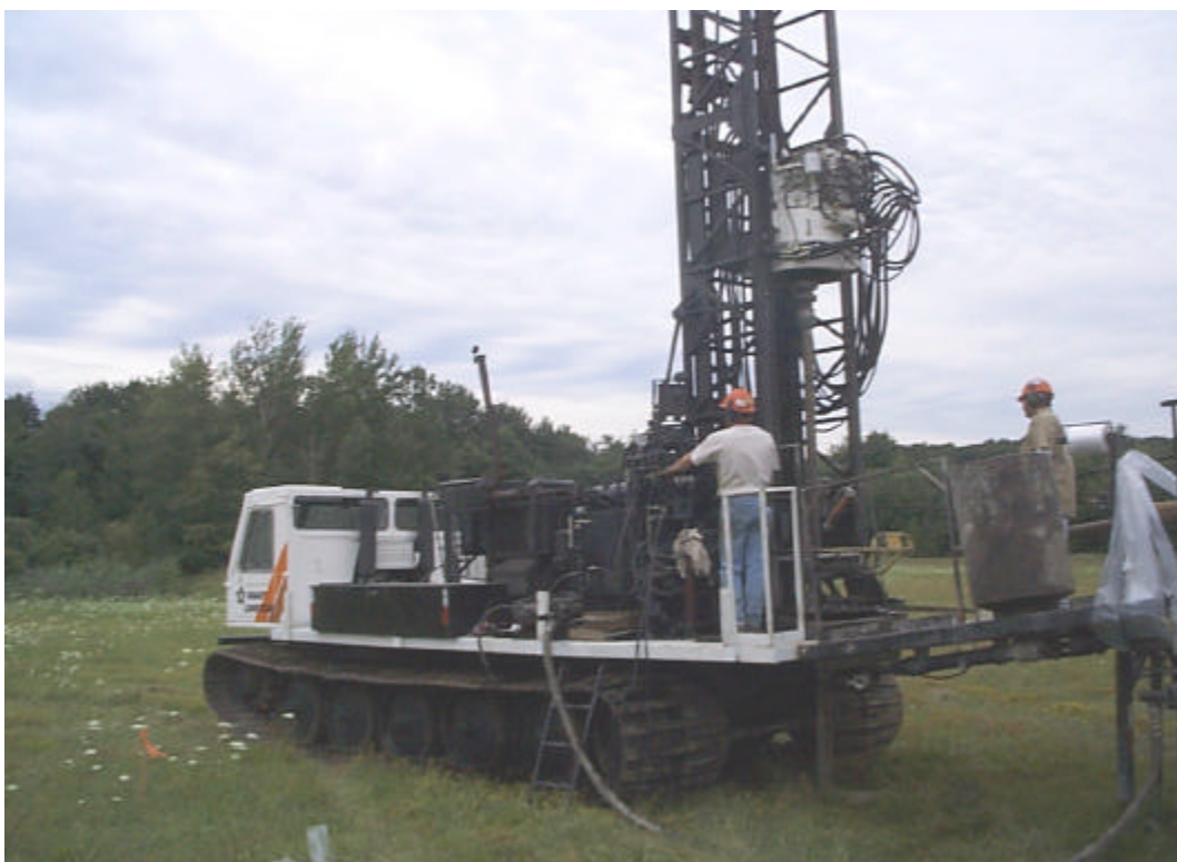
Photograph 4b – Track mounted ATV rig.