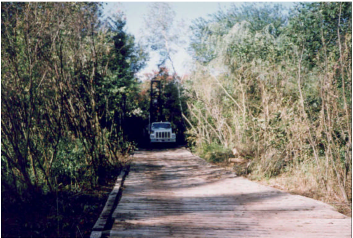
Photograph 3a – Drill rig accessing wetlands using temporary roadway.